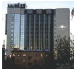
Hotel Bristol Sarajevo Fra Filipa Lastrića 2, Sarajevo 71000 Bosnia and Herzegovina www.bristolsarajevo.com